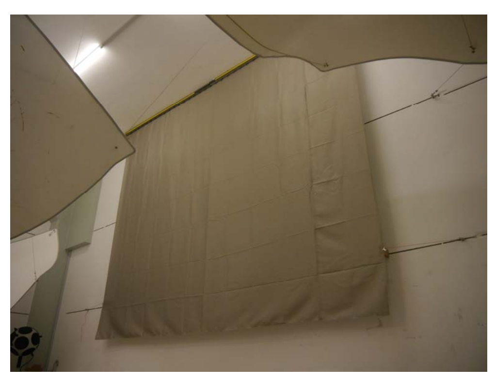
Figure B.2. Flat arrangement, test arrangement in the reverberation room: diagonal view.