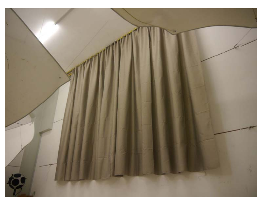
Figure B.4. Folded arrangement, test arrangement in the reverberation room: diagonal view.